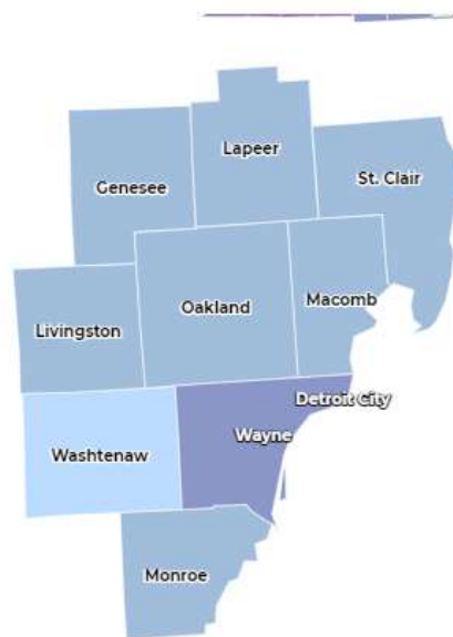
Table 1-3 (Updated as of 07-2-2021)

County risk levels calculated from July 2, 2021 data, explanation