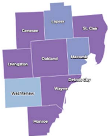
County risk levels calculated from June 11, 2021 data, explanation