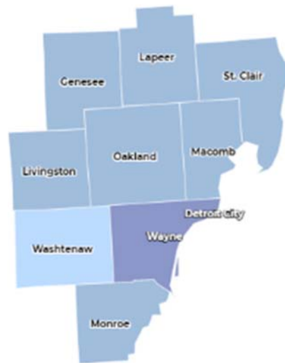
County risk levels calculated from July 2, 2021 data, explanation